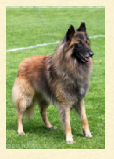
Czech Belgian Shepherd Tervuren