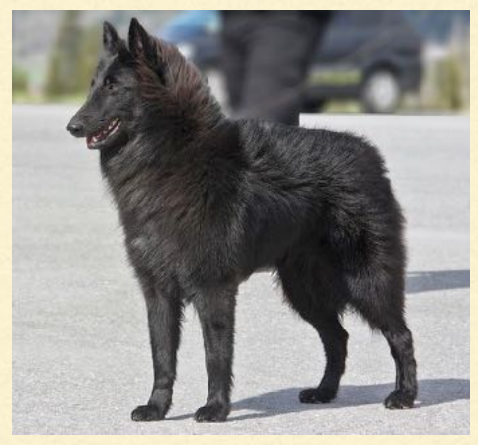
Dam is a Norwegian Belgian Shepherd Groenendael