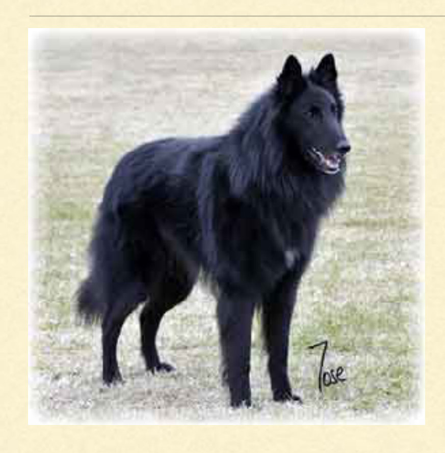
Sire: French Belgian Shepherd Groenendael