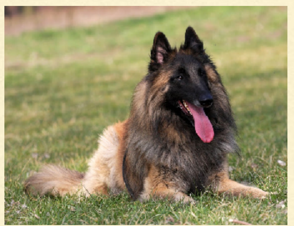
Sire is a CZ born Belgian Shepherd Tervuren