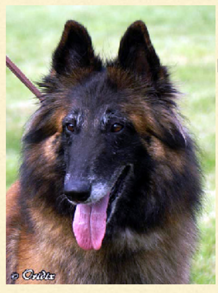
Dam is a Czech Belgian Shepherd Tervuren