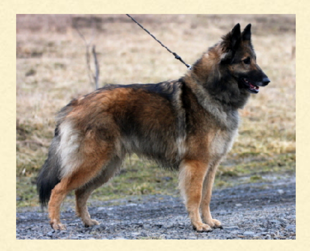
Offspring: AKC Belgian Sheepdog