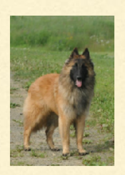
Czech Belgian Shepherd Tervuren