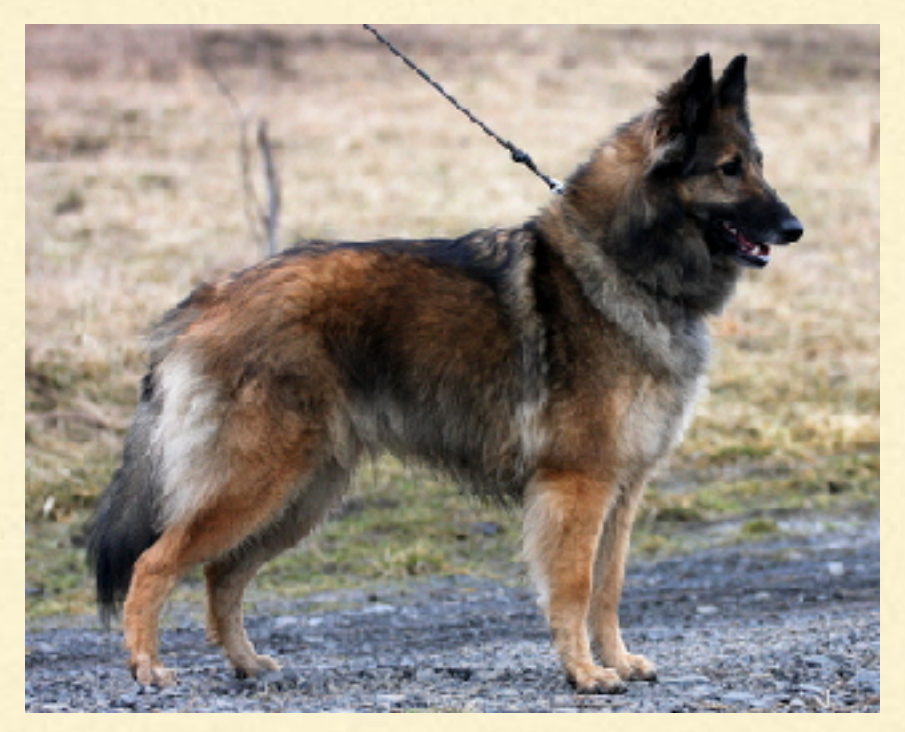
Dam is an AKC Belgian Sheepdog exported to CZ from the US. Registered in CZ as a Belgian Shepherd Tervuren