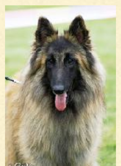
Offspring: French Belgian Shepherd Tervuren