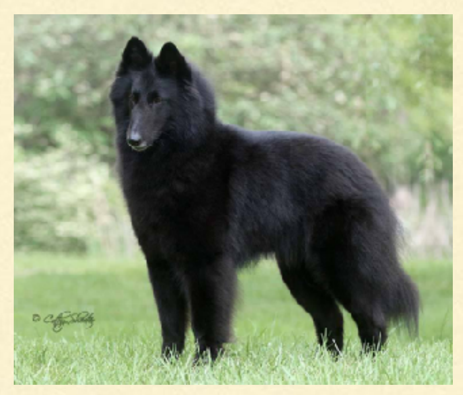
Offspring: AKC Belgian Sheepdog