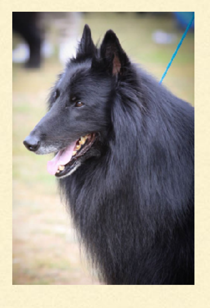
Sire is a French Belgian Shepherd Groenendael