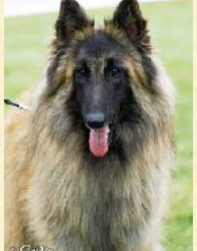
Bred to a Czech Belgian Tervuren female very typical Tervuren were produced, both of those pictured earned championships.